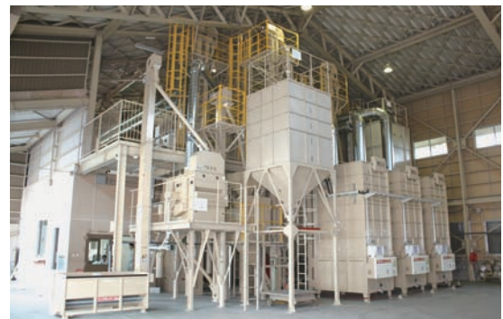
Seed Drying Device

Our main sales included: in the agricultural plant business, the repair work for seed drying devices and country elevators for the Japan Agricultural Cooperatives (JA); in the train inspection and maintenance business, various facilities for JR Companies; in the transportation system business, special flat wagons for steel mills; in the paper-manufacturing machinery business, processing equipment for household paper manufacturers. Sales also included laser processing machines, railway memorabilia, and income from golf course operations.