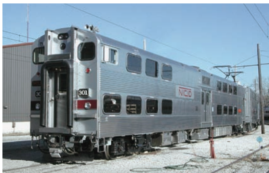
Bi-Level Passenger Car

Corporation; the Series 2300 limited express EMUs, the Series 5000 EMUs, the Series 4000 EMUs and the Series 3150 EMUs for the Nagoya Railroad Co., Ltd.; the Series 9000 EMUs for the Tokyo Metro Co., Ltd.; the Series N1000 EMUs for the Transportation Bureau, the City of Nagoya; the