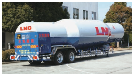
LNG Tank Trailer

In other transportation equipment business areas, there was demand not only for our main products of LPG-related products such as consumer-purpose LPG bulk tank lorries but also for LNG-related products. Our sales remained steady as we recorded sales of heavy-duty industrial vehicles such as carriers and automated guided vehicles and containers.