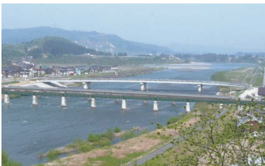
the Kawaguchi Bridge

In the steel structure business which faces a reduction of orders for steel bridges due to the cutbacks in public works projects, we have strengthened cost management as well as improved our