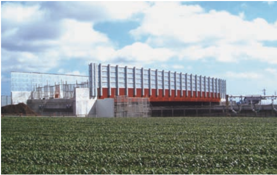
the Sakamoto Bo Bridge

fabrication and construction of road bridges such as the Kurosaki Elevated Bridge, the Shimomio Bridge, the Futamatao Ohashi Bridge and the Kawaguchi Bridge, as well as the construction of the Odaka Footbridge, the Sakamoto Bo Bridge and the Ueji Bo Bridge. As for railway bridges, our sales included the fabrication and construction of the Bantan Elevated Bridge.