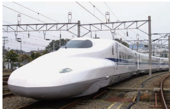
Series N700 Shinkansen Train

In railway rolling stock, our sales to the JR Companies include the Series N700 Shinkansen trains for JR Central and the first one train unit for direct service through the Sanyo and Kyushu Shinkansen lines for JR West, which amounted to ¥27,910 million. Our sales of EMUs for the public and private railways reached ¥9,363 million, including sales of: the Series 9000 EMUs for the Keio